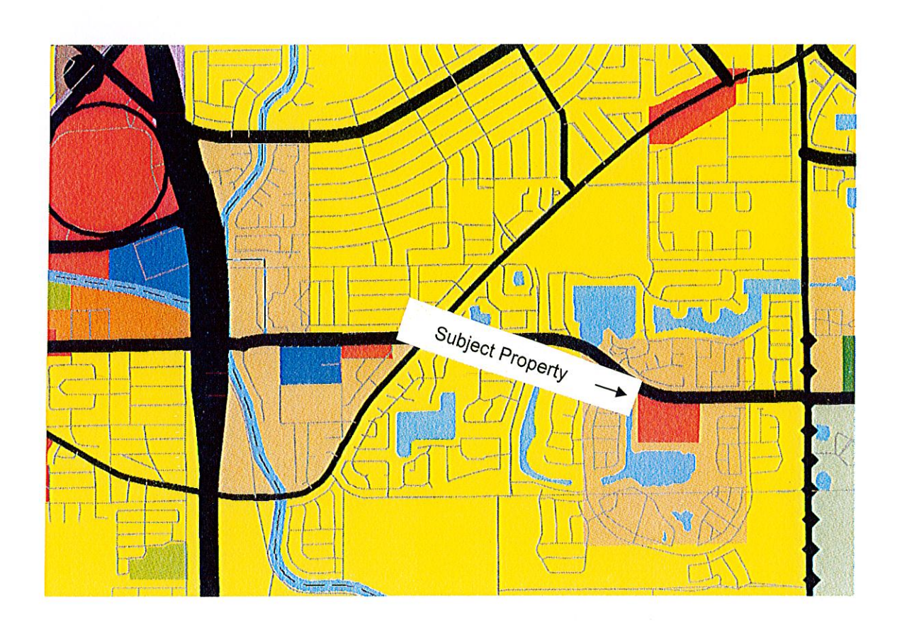
Vista Del Lago Application No. SP07-10-01